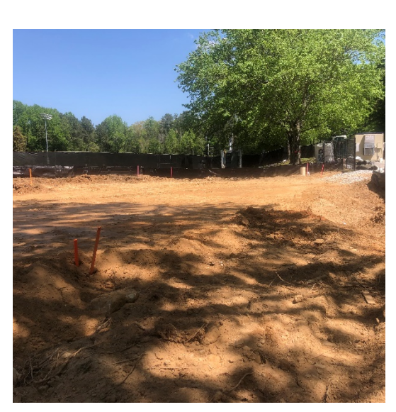
Building Pad Subgrade Prep